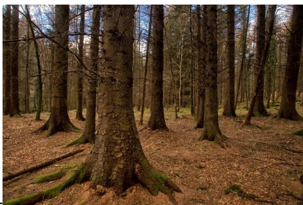
Tollymore Forest Park

Afternoon Trek in Tollymore Forest (3km). This forest park, covering 1,600 acres was used as the backlot for many key scenes, including where Wills finds the dismembered bodies in the snow, Tyrion and Jon's campfire on their journey north to the wall, and the bridge where the Starks discover a dead direwolf and her pups.