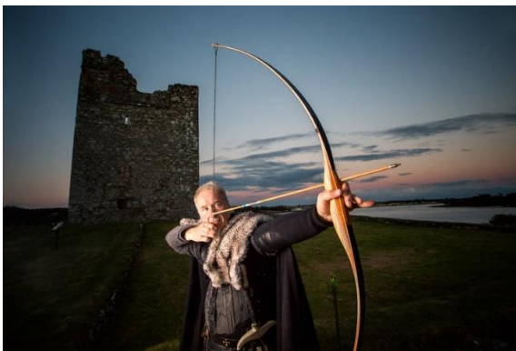
Castle Ward ~ Winterfell

Morning Trek at Winterfell (3km). Visit to Castle Ward Estate - there are nine Game of Thrones® film locations on site, all close together. A 16 th century castle and stable yard is the film location of Winterfell. Nearby, on the wooded shores of Strangford Lough, a 15th century Tower House, known as Audley's Castle served as one of Walder Frey's Twins and as the location of Robb's Camp, Oxcross. Other classic scenes filmed nearby include the spot where Brienne of Tarth dispatched three Stark bannermen and the Battlefield of Baelor.