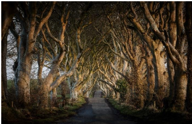
The Dark Hedges

Walk down the haunting avenue of beech trees, through which Arya and Gendry escaped King's Landing. Following the death of her father, Ned Stark, Arya escapes King's Landing disguised as a boy. Travelling on the Kingsroad in the back of a cart along with Yoren, Gendry and Hot Pie, all new recruits for the Night's Watch, Arya starts her long and arduous journey north.